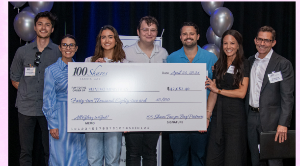
VU VI VO Ministries