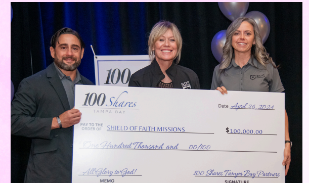
Shield of Faith Missions

For those who haven't made their 2024 pledge yet, there's still time to contribute and be a part of this meaningful endeavor. For more information, visit our website and click on Ways to Give.