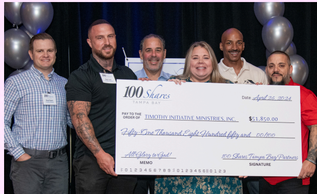
Timothy Initiative Ministries, Inc